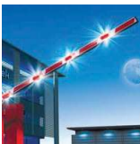
LED Beam Lamp Package

Choose your beam length from a 3m or 4.5m rectangle profile, or a 6m round profile, each made of durable painted aluminium