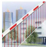
Beam Skirt Kits 2m or 3m