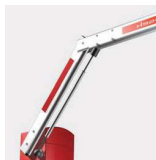
Articulated Arm Bracket