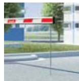
Pendulum Arm Support