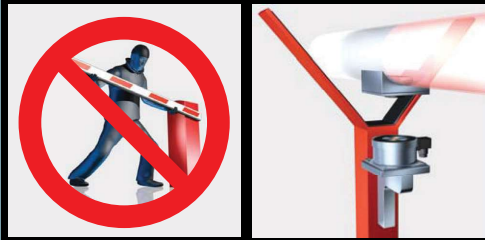
Secure your beam with a magnetic lock kit (Magnetic lock and fork support sold separately)

THE MOST SECURE 230V COMMERCIAL GRADE BARRIER ON THE MARKET