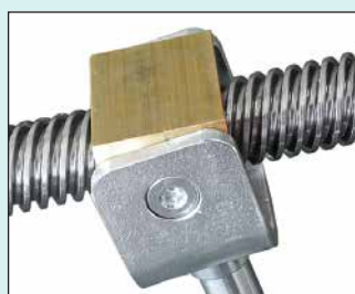
Large spindle & sprocket