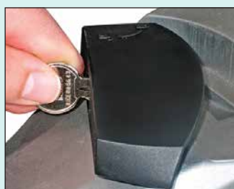
Euro-key manual release