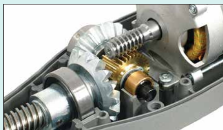
Quality metal gears