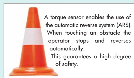
ARS (Automatic Reverse System)