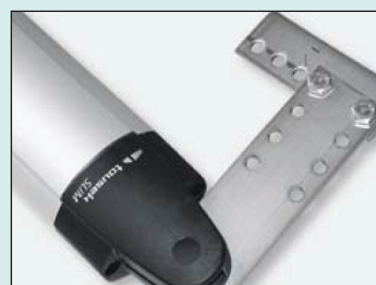
Adjustable Mount Included