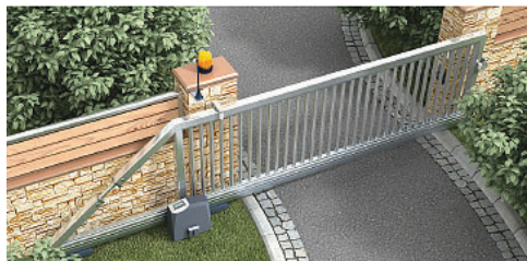
Encoder for precision

Power saving mode offers energy efficiency