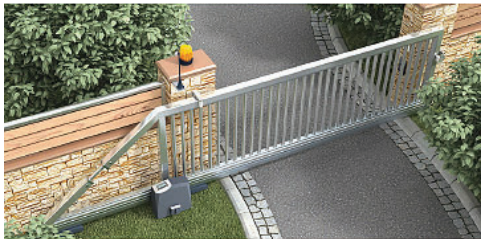
Encoder for precision