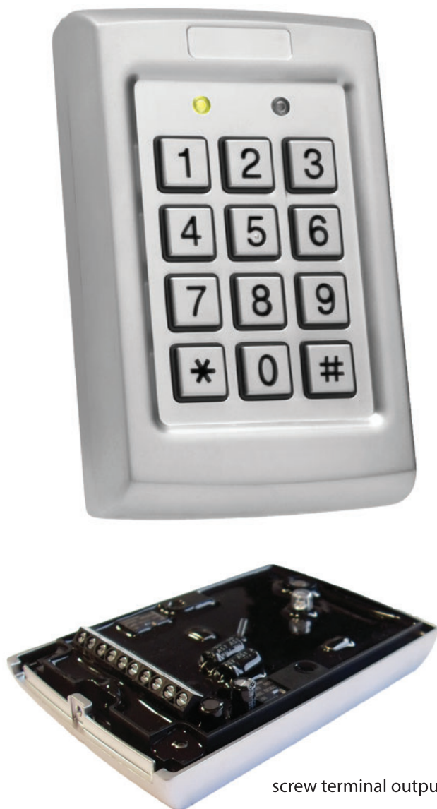
screw terminal output