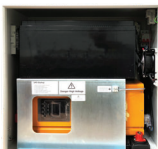
Professional 230V UPS