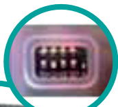
Simple Force and Motor selection with dipswitches

*Use of electric lock is recommended for leaf sizes over 2.4m